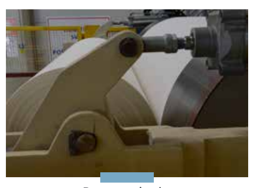
Raw paper jumbo