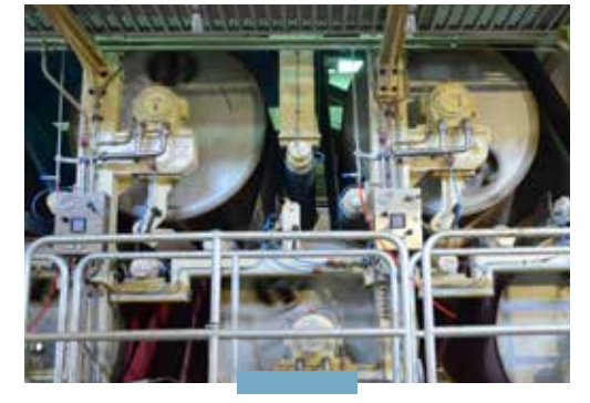
Pressing and drying station